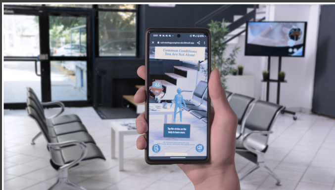
HIV-23-April | Body Widget

Shows the ranges of symptoms someone may experience with HIV.