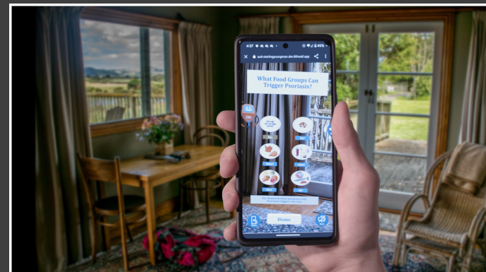
Psor-23-June | Spinning Plates

Shows the food triggers and alternatives with Psoriasis.